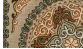
STARFISH Background Code M15 A combination of colours: Navy Blue, Turquoise, Marine Blue and Beige