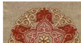
STARFISH Background Code M28 A combination of colours: Bright Red, Warm Brown and Ivory