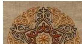
STARFISH Background Code M17 A combination of colours: Dark Brown, Warm Brown and Old Gold