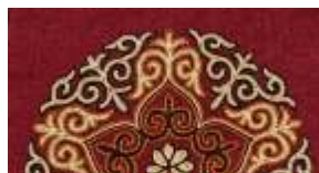
RED Background Code M17 A combination of colours: Dark Brown, Warm Brown and Old Gold