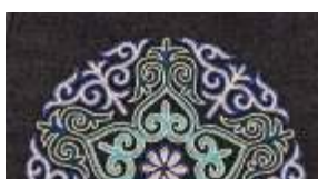
BLACK Background Code M31 A combination of colours: Navy Blue, Turquoise, Marine Blue and Ivory