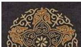
BLACK Background Code M17 A combination of colours: Dark Brown, Warm Brown and Old Gold