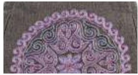
GREY Background Code M14 A combination of colours: Lilac, Mauve and Grey