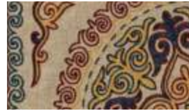
STARFISH Background Code M13 A combination of colours: Deep Red, Marine Blue and Old Gold