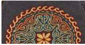
GREY Background Code M13 A combination of colours: Deep Red, Marine Blue and Old Gold