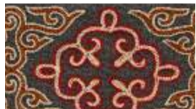
GREY Background Code M28 A combination of colours: Bright Red, Warm Brown and Ivory