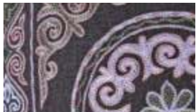
BLACK Background Code M14 A combination of colours: Lilac, Mauve and Grey