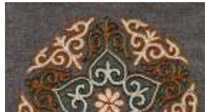
GREY Background Code M15 A combination of colours: Spruce Green, Ivory and Warm Brown