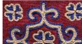
RED Background Code T03 A combination of colours: Royal Blue and Ivory