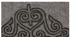
GREY Background Code T10 A combination of colours: Black and Grey