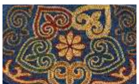
BLUE Background Code X51 A combination of colours: Old Red, Marine Blue, Spruce Green, Warm Brown and Light Gold