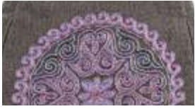
GREY Background Code M14 A combination of colours: Lilac, Mauve and Grey