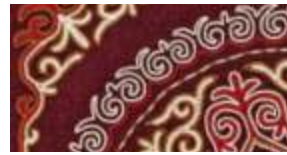
RED Background Code M28 A combination of colours: Bright Red, Warm Brown and Ivory