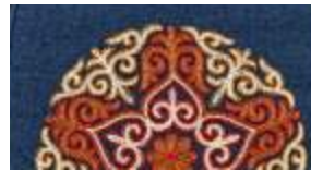
BLUE Background Code M28 A combination of colours: Bright Red, Warm Brown and Ivory