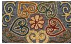
GREY Background Code X51 A combination of colours: Deep Red, Marine Blue, Spruce Green, Warm Brown and Light Gold