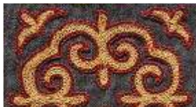
BLACK Background Code T01 A combination of colours: Deep Red and Old Gold