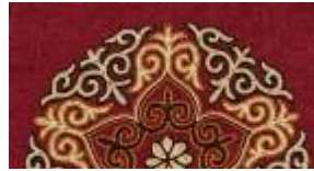
RED Background Code M17 A combination of colours: Dark Brown, Warm Brown and Old Gold