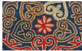
BLUE Background Code X53 A combination of colours: Bright Red, Dark Brown, Warm Brown, Pecan Brown and Old Gold