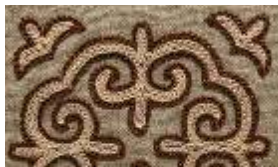
STARFISH Background Code T05 A combination of colours: Pecan Brown and Ivory