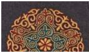
BLACK Background Code M13 A combination of colours: Deep Red, Marine Blue and Old Gold

The following pages give photos and descriptions of our material and embroidery thread combinations used in our ethnic Kazakh product designs. The background colour abbreviations and the thread codes will help you to identify the products you are ordering through our Price List. NOTE: The artisan receives the thread colours and it is their choice where to place the colours within the stencilled pattern hand-marked on the fabric as a guide. The variety of artisan combinations give a range of very individual products.