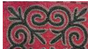
RED Background Code T10 A combination of colours: Black and Grey