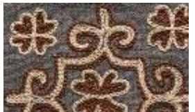
GREY Background Code T05 A combination of colours: Pecan Brown and Ivory