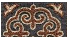
BLACK Background Code T05 A combination of colours: Pecan Brown and Ivory