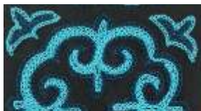
BLACK Background Code T06 A combination of colours: Turquoise and Marine Blue