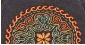
GREY Background Code M13 A combination of colours: Deep Red, Marine Blue and Old Gold