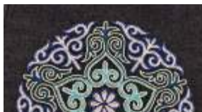
BLACK Background Code M31 A combination of colours: Navy Blue, Turquoise, Marine Blue and Ivory