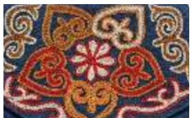
BLUE Background Code X41 A combination of colours: Orange, Warm Brown, Ivory, Bright Red and Mustard Brown