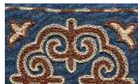
BLUE Background Code T05 A combination of colours: Pecan Brown and Ivory