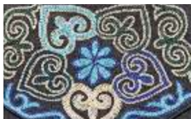
BLACK Background Code X52 A combination of colours: Navy Blue, Turquoise, Spruce Green, Marine Blue and Ivory