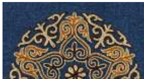
BLUE Background Code M17 A combination of colours: Dark Brown, Warm Brown and Old Gold