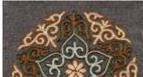
GREY Background Code M15 A combination of colours: Spruce Green, Ivory and Warm Brown