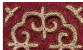
RED Background Code T05 A combination of colours: Pecan Brown and Ivory