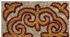
STARFISH Background Code T01 A combination of colours: Deep Red and Old Gold