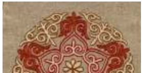
STARFISH Background Code M28 A combination of colours: Bright Red, Warm Brown and Ivory