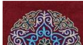
RED Background Code M31 A combination of colours: Navy Blue, Turquoise, Marine Blue and Ivory