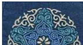
BLUE Background Code M31 A combination of colours: Navy Blue, Turquoise, Marine Blue and Ivory