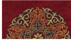
RED Background Code M13 A combination of colours: Deep Red, Marine Blue and Old Gold