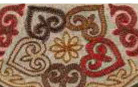
STARFISH Background Code X53 A combination of colours: Bright Red, Dark Brown, Warm Brown, Pecan Brown and Old Gold