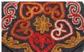
BLACK Background Code X41 A combination of colours: Orange, Warm Brown, Ivory, Bright Red and Mustard Brown