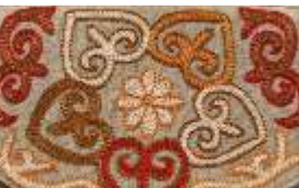
STARFISH Background Code X41 A combination of colours: Orange, Warm Brown, Ivory, Bright Red and Mustard Brown