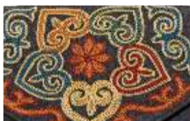
BLACK Background Code X51 A combination of colours: Deep Red, Marine Blue, Spruce Green, Warm Brown and Light Gold