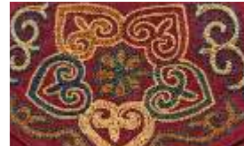
RED Background Code X51 A combination of colours: Deep Red, Marine Blue, Spruce Green, Warm Brown and Light Gold