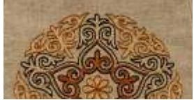
STARFISH Background Code M17 A combination of colours: Dark Brown, Warm Brown and Old Gold