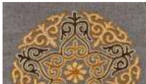
GREY Background Code M17 A combination of colours: Dark Brown, Warm Brown and Old Gold