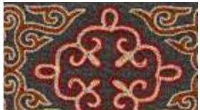
GREY Background Code M28 A combination of colours: Bright Red, Warm Brown and Ivory