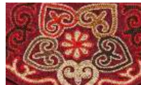
RED Background Code X53 A combination of colours: Bright Red, Dark Brown, Warm Brown, Pecan Brown and Old Gold