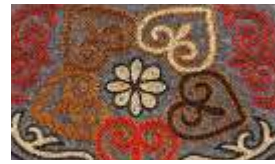
GREY Background Code X53 A combination of colours: Bright Red, Dark Brown, Warm Brown, Pecan Brown and Old Gold