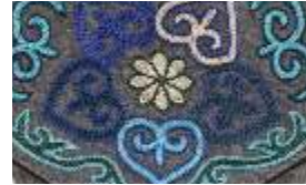
GREY Background Code X52 A combination of colours: Navy Blue, Turquoise, Spruce Green, Marine Blue and Ivory