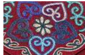
RED Background Code X52 A combination of colours: Navy Blue, Turquoise, Spruce Green, Marine Blue and Ivory