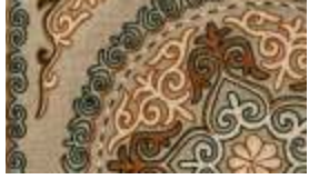
STARFISH Background Code M15 A combination of colours: Navy Blue, Turquoise, Marine Blue and Beige