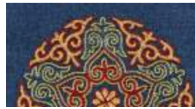
BLUE Background Code M13 A combination of colours: Deep Red, Marine Blue and Old Gold