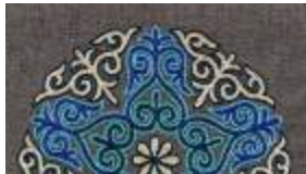
GREY Background Code M31 A combination of colours: Navy Blue, Turquoise, Marine Blue and Ivory