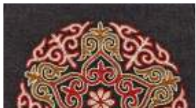
BLACK Background Code M28 A combination of colours: Bright Red, Warm Brown and Ivory