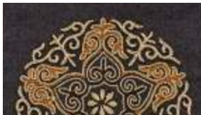
BLACK Background Code M17 A combination of colours: Dark Brown, Warm Brown and Old Gold