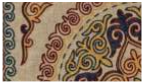
STARFISH Background Code M13 A combination of colours: Deep Red, Marine Blue and Old Gold